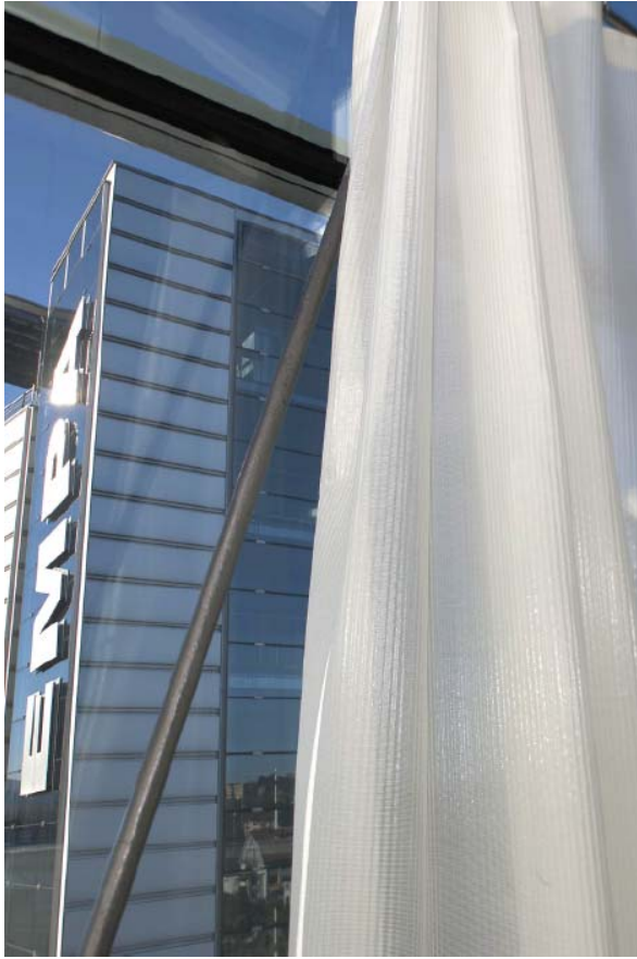
The new sound absorbing curtain «in the field» in a seminar room at Empa in St. Gallen