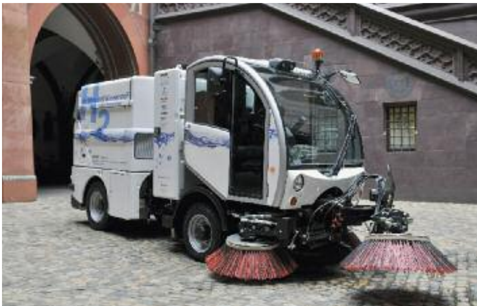
The “Bucher Schörling CityCat H 2 ” on the streets of Basel – in the first phase of this project, the world’s first municipal vehicle with a hydrogen powertrain consumes on average only half as much fuel as a conventional vehicle.