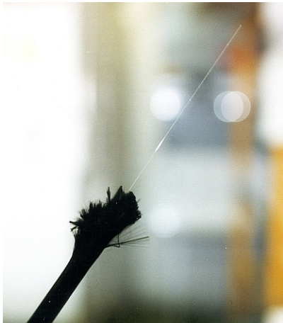
FRP cable with fiber optic sensors in the middle